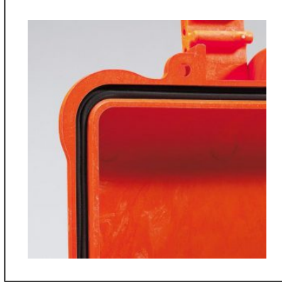
SEALING O-RING (Art. NEOSEAL + nr. art.)