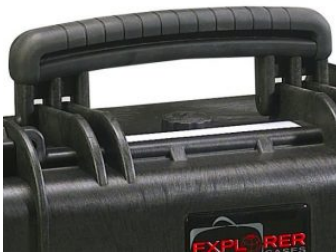
SOFT GRIP RUBBER HANDLE

Asa de carga comprobada, reforzada con pasadores de acero a prueba de corrosión