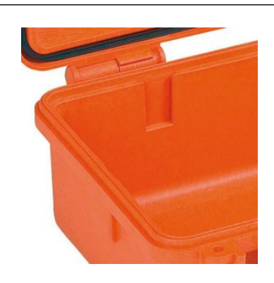
INTERNAL SLOTS Internal slots for optional panel mounting brackets or panel mounting rings