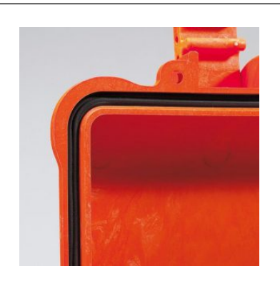
SEALING O-RING (Art. NEOSEAL + nr. art.)