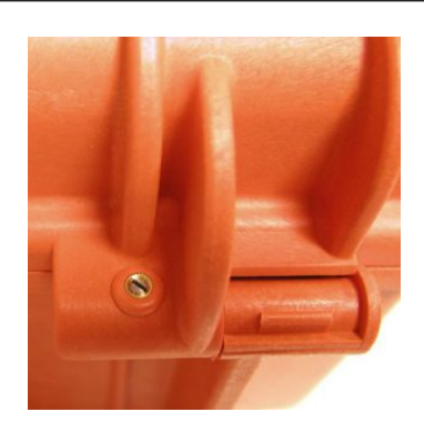
LID CAN BE SET TO SLIDE-OFF By releasing the back screw, lid becomes set to slide-off when opened at 70°