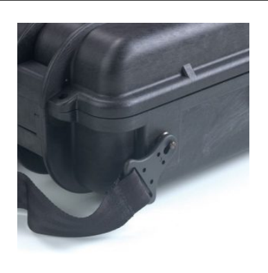
OPTIONAL SHOULDER STRAP (universal) (art. SHOULDERKIT.U)