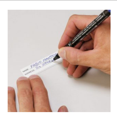
PVC WATERPROOF I. D. REMOVABLE LABEL (Art. LABELCOVER + nr. art.)