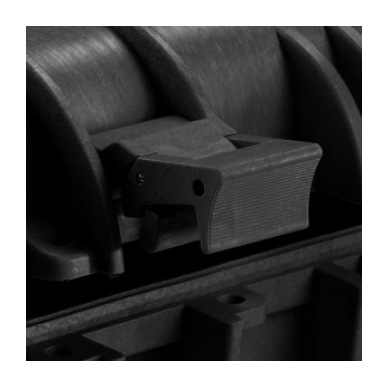
JAM FREE LATCHES WITH EASY-OPENING MECHANISM (from model 3818 on)

Additional fixing points on the lid, available on certain models