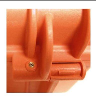
LID CAN BE SET TO SLIDE-OFF By releasing the back screw, lid becomes set to slide-off when opened at 70°