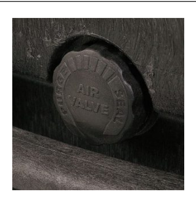
MANUAL PRESSURE RELEASE VALVE

The internal stop ring prevents valve from being completely extracted (Art. PURGEVALVE.B)