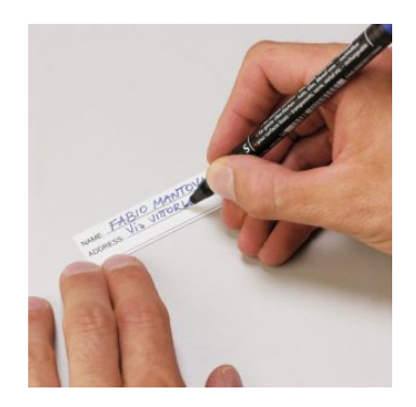
PVC WATERPROOF I. D. REMOVABLE LABEL