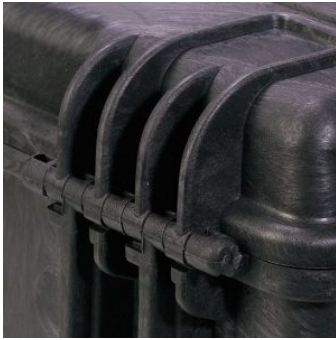
CORROSION PROOF METAL HINGES WITH LID STAY FEATURES