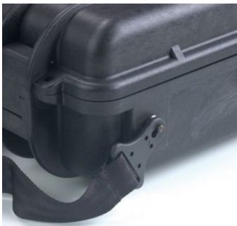
OPTIONAL SHOULDER STRAP (universal) (art. SHOULDERKIT.U)