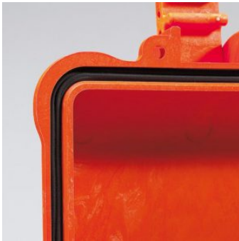
SEALING O-RING (Art. NEOSEAL + nr. art.)