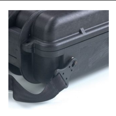
OPTIONAL SHOULDER STRAP (universal) (art. SHOULDERKIT.U)