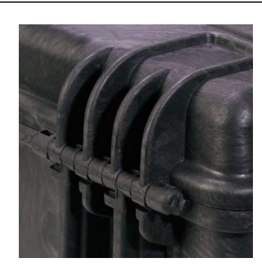
CORROSION PROOF METAL HINGES WITH LID STAY FEATURES