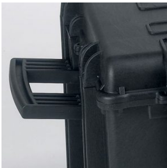
TWO MAN LIFT SIDE HANDLES