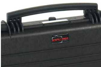
LARGE FRONT HANDLE