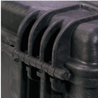
CORROSION PROOF METAL HINGES WITH LID STAY FEATURES