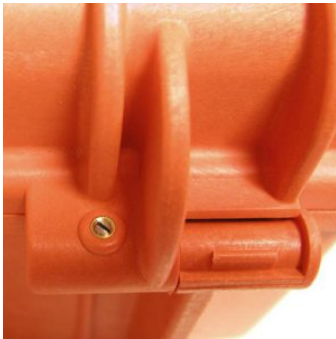
LID CAN BE SET TO SLIDE-OFF

By releasing the back screw, lid becomes set to slide-off when opened at 70°